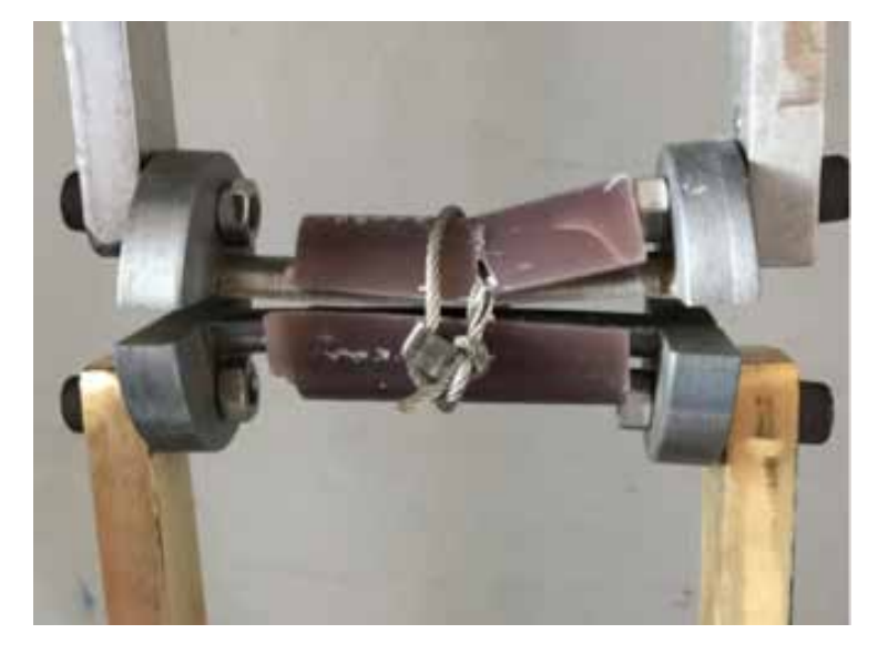
Figure 3. Failure of the system: breakage of upper saw bone fragment.

knob was used to create tension to 90 lb/in2 (62,05 N/cm2) [15]. The sleeve was crimped with crimp tool. These procedures were the same for the two groups. In the sleeve + knot group, one more simple knot was performed with conventional surgery skill, and the two ends of cerclage wire were put into the